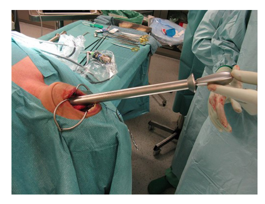
Figure 2 Using the cervicoscope in patients by Karakas (14).

This access was used by Karakas et al. too in his animalstudy in 2010 (8). They described the so-called transoral partial parathyroidectomy (TOPP)-technique as a new transoral method. The access via the sublingual access was performed more dorsally, directly in front of the trachea. It is setting up a space at the dorsal side of the thyroid gland. After feasibility studies in ten living pigs they performed parathyroidectomies in two patients, with one patient undergoing a transient palsy of the hypoglossal nerve. He reported on the patient's low acceptance of the transoral procedure and concluded that the adequate resection is not possible with the actually available instruments (13). In 2014 they reported on five patients who agreed for the TOPP method. In three of them the endoscopic procedure could be completed, in these three patients, a parathyroid adenoma could be removed via the transoral access. In two patients, the procedure had to be converted to the