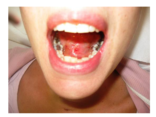
Figure 4 Own patient 4 days after transoral thyroid resection.

Conflicts of Interest: The authors have no conflicts of interest to declare.